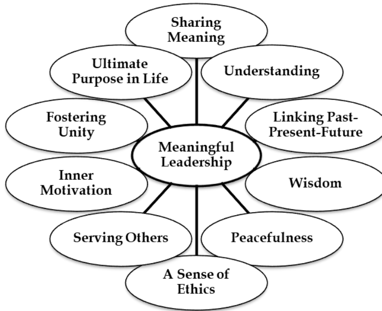
Figure 1 gives visualization to dimensions within meaningful leadership. Each of these qualities are explained separately below with “quotes” from the participants.

The dimensions of Meaningful Leadership based on participants' opinions