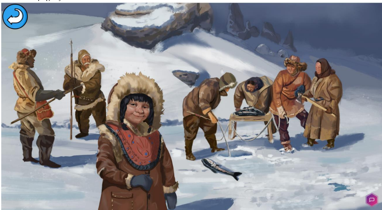
Chat homepage of Kirima